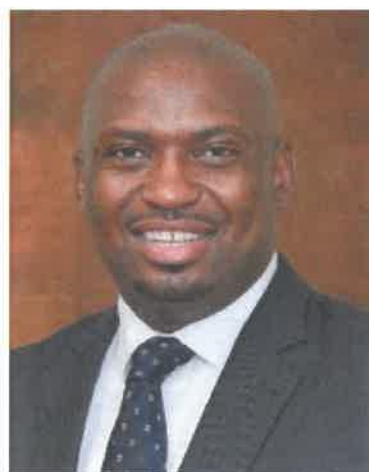
Deputy Minister of Higher Education and Training Mr Buti Manamela