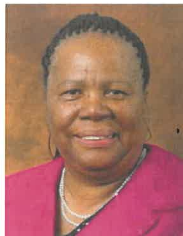
Minister of Higher Education and Training Mrs Grace Naledi Mandisa Pandor

The NSDP and the new SETA Landscape will be ushered in on 1 April 2020. This new dispensation will bring about changes with regards to the leadership and governance in Skills Development. SETAs will remain an authoritative voice of the labour market and experts in their respective sectors. For the country to achieve high levels of economic growth and address unemployment, poverty and inequality, social partners must work together to invest in skills development in order to achieve the vision set in the NSDP of an educated, skilled and capable workforce for South Africa.